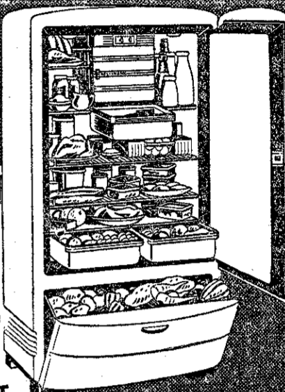
Model illustrated is K-6—

CALLING ALL HOUSEWIVES! Come in—help us celebrate Kelvinator's 25th Anniversary . . . the biggest event in our history. For never before have we been able to offer such refrigerator values as these beautiful new 1939 Silver Jubilee Kelvinators.