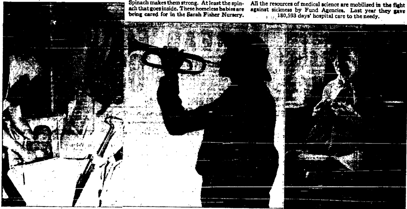
Last year one out of every four babies born in the metropolitan area was cared for by the Visiting Nurse Association, a Fund Agency.