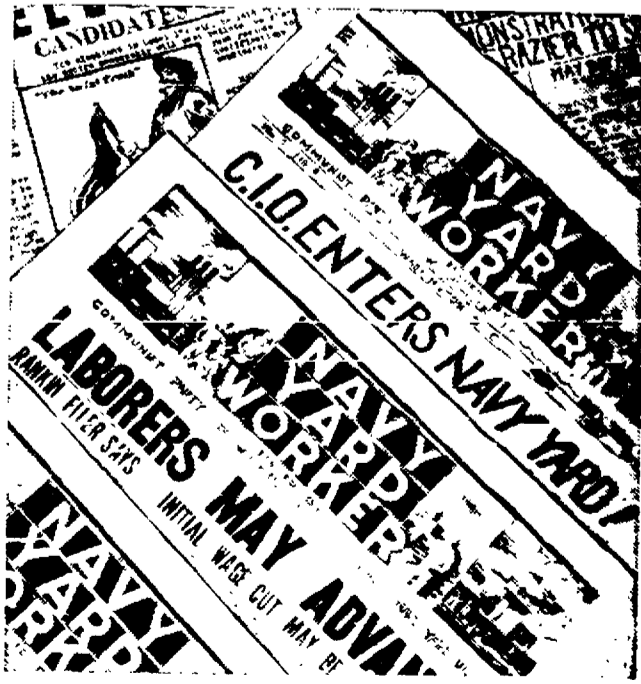
Fragments of copies of Navy Yard Worker, expected to be introduced as evidence before Dies Committee. Publication, circulated among workmen in Washington navy yard, is alleged enterprise of Communist party.