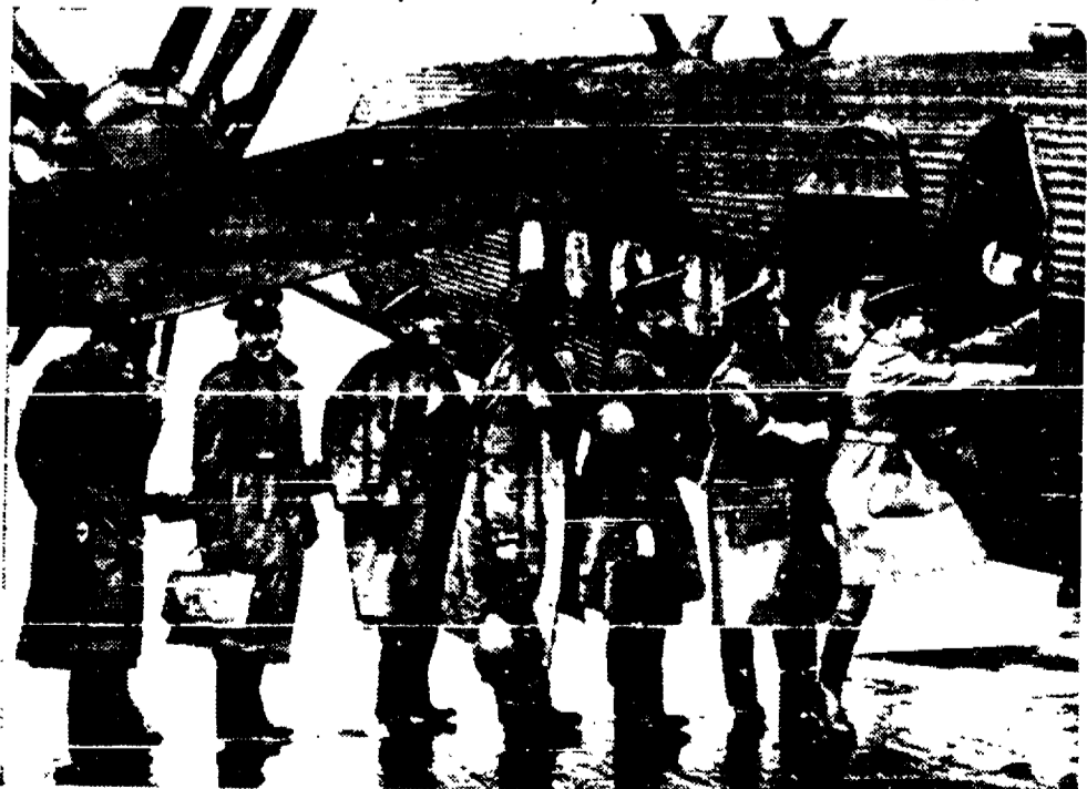
They look as if they might be the General Staff—but they're actually war correspondents boarding a France-bound plane in England. They wear the new official uniform for correspondents, which is similar to a British officer's, except for special badges marked "C".