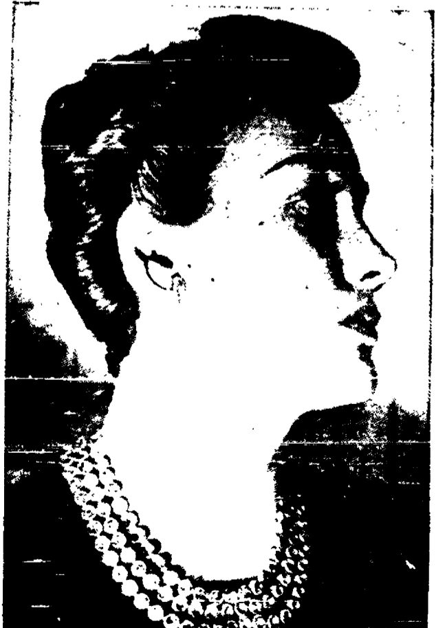
Perfect for the sophisticate is this streamlined up-and-down hairdo. The hair is drawn rather severely up at sides, with the waved sections disappearing into the back rolls instead of being finished in top-knot curls. There's a thick roll behind each ear, and a swirl across the back of the head. A smaller roll is posed just above the forehead.