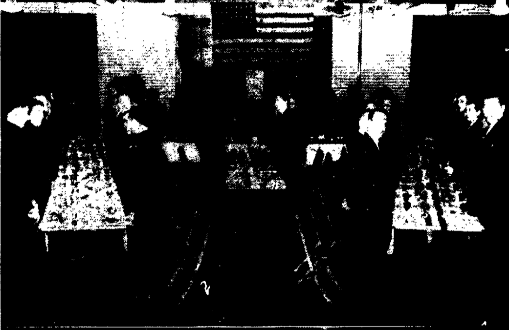
Grosse Pointe Park firemen held a banquet in the municipal firehall on Jan. 22, when newly-elected officers of the Fire Fighters Association, Local No. 532, were installed.