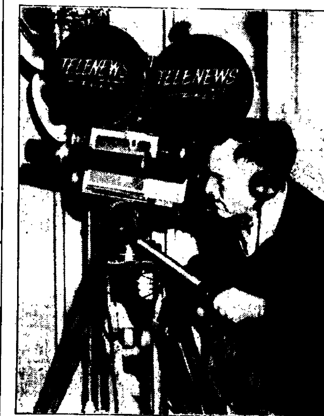
A newsreel cameraman, like this one, will be stationed in Detroit to cover the drama of wartime production in the nation's leading industrial area. He will be an important member of the staff of the Telenews Theater, Detroit's new newsreel house, which is to open its doors at 1540 Woodward avenue, Friday night, Feb. 13, with a grand premiere, entire proceeds of which will go to further the patriotic work of the Navy-Citizens Committee.