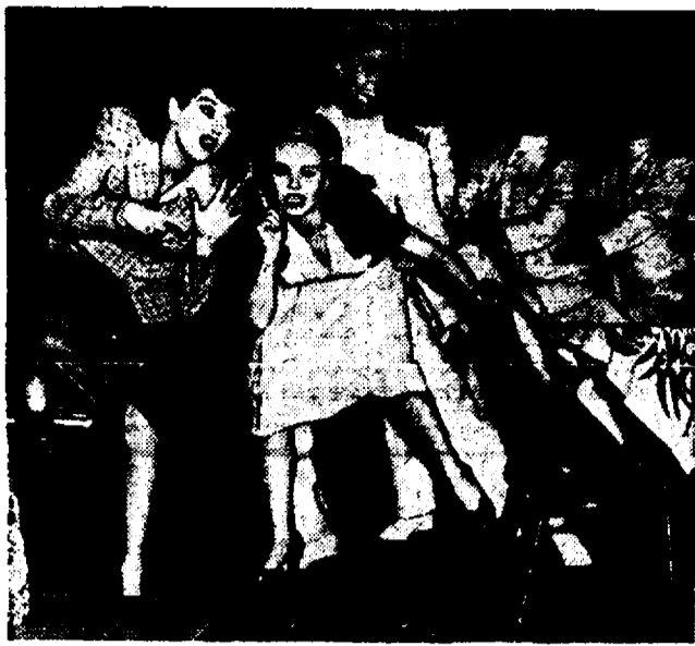
Rag-cutting and romance wax hot as Rosalind Russell and Janet Blair compete with the Navy in Columbia's "My Sister Eileen" which comes to the Esquire Sunday and Monday.