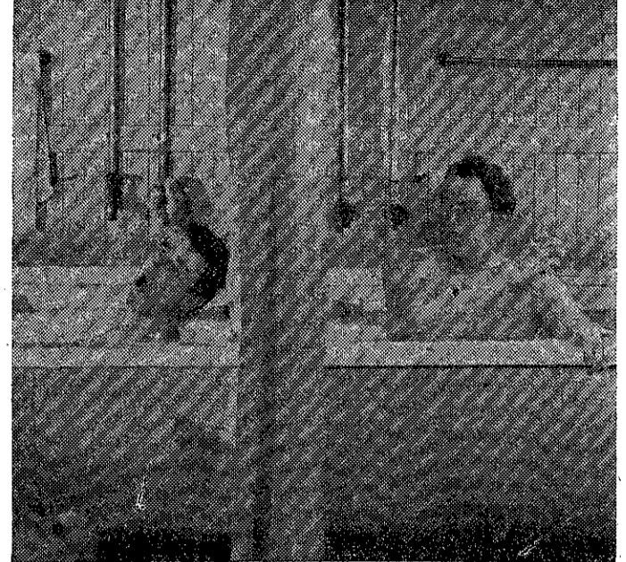
JOHN WAYNE and Albert Dekker, in an amusing scene from the thrilling historic film "In Old Oklahoma" playing at the Esquire Sunday and Monday, May 21 and 22.