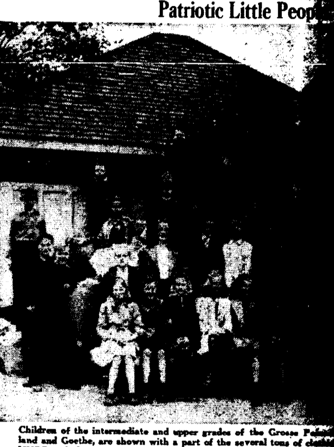
Children of the intermediate and upper grades of the Grosse Pointe Park Community Day School, Maryland and Goethe, are shown with a part of the several tons of clothing which they collected for the UNRRA clothing drive during the last week in April.