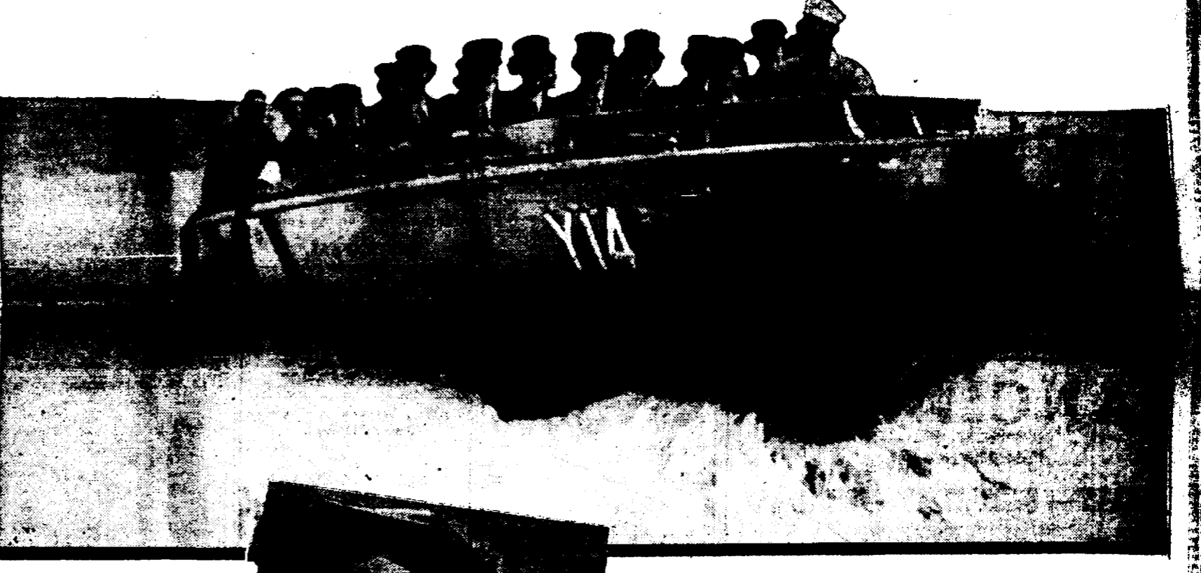
GANGWAY for the Marines! Maybe you'll be assigned to jump a jeep through its paces in Motor Transport.