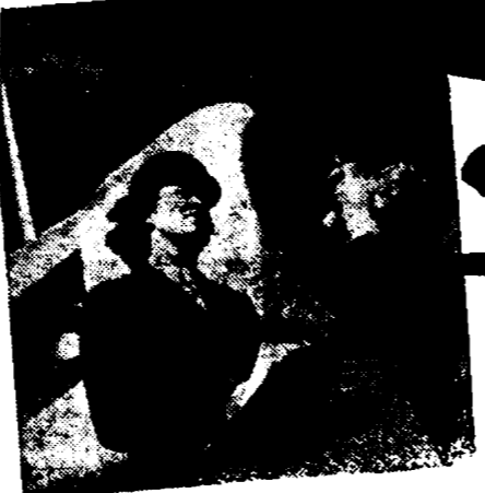
Marines receive training that will be invaluable in post-war "Age of Flight" careers.