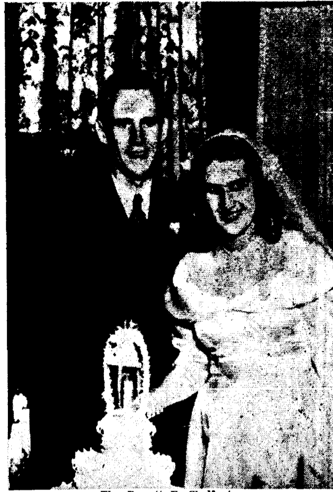
The Everett F. Chalfant