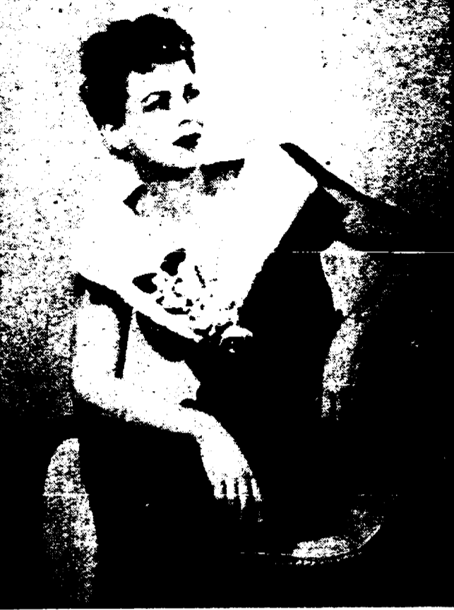
Brightest new star to join the ABC firmament in 1948 is Evelyn Knight, whose songs enliven the popular "Texaco Star Theatre," which also includes Tony Martin, comedian Alan Young and Victor Young's orchestra. Appropriately, the Texaco show bowed in New Year's Eve in its new Wednesday night spot.