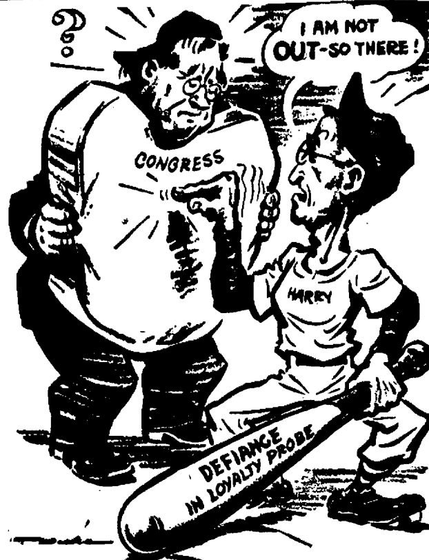
— BUT IT WON'T BE LONG NOW !

Grosse Pointe Township was cited as an utopia of safety for school children by the AAA.