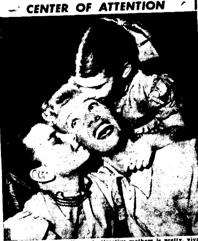
One of Hollywood's most attractive mothers is pretty, vivacious Penny Singleton, star of CBS' 'Blondie' series...

Situation wanted notices for job seekers.