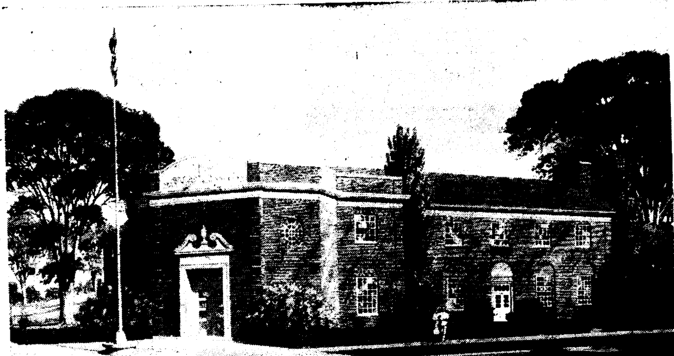
PROPOSED HALF-MILLION DOLLAR GROSSE POINTE MEMORIAL LIBRARY