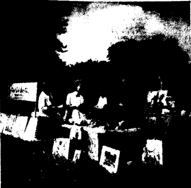
Close to 500 persons attended the First Curb Art Fair, at Cadieux and Kercheval last week which exhibited the art of 25 outstanding artists whose work is well known and recognized in New York as well as here.