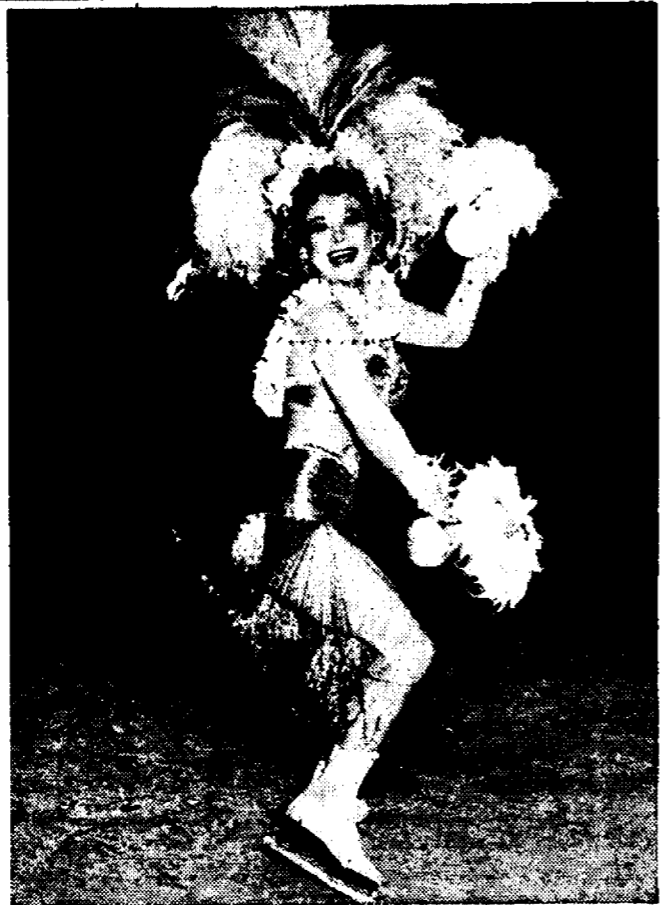
Sonia Henie and her hula routine presented in her 1949 Hollywood Ice Revue appearing at Olympia for 22 performances February 10th through March 3rd.