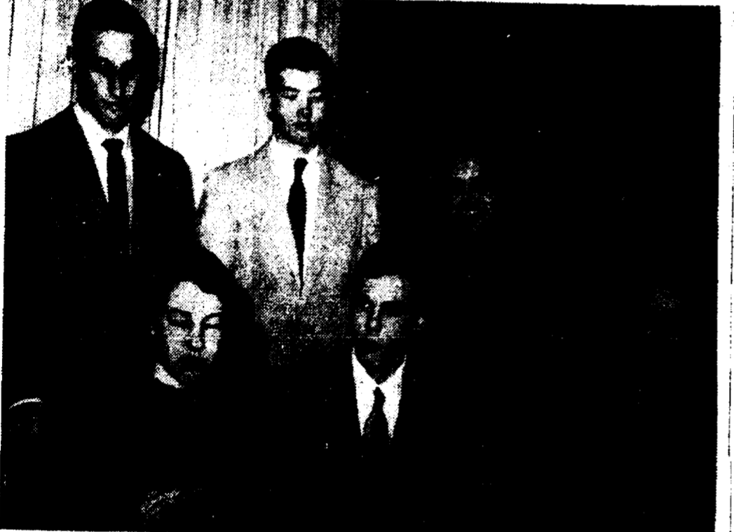
Though their Grosse Pointe High School studies are behind them, this sextet of honor graduates lost no time in making plans for their higher education...