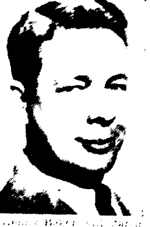
Opera star portrait, likely related to the 'OPERA STAR' section.