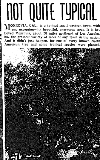
This giant old rubber tree shades benches in the city park.