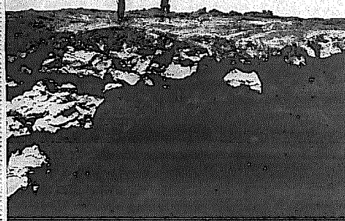
DIMINUTIVENESS of two tourists illustrates the great size of this lava cave at the Craters of the Moon, national monument at Arco, Id., which will be opened to the public May 23.