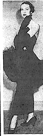
ANKLE-LENGTH evening gown of black faille, designed with a long tunic which juts out stiffly and ends in tulle ruffles, is part of a potpourri from Paris.