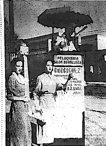
NO DODGING TRAFFIC for policemen in Santiago, Chile. Each officer is stationed in a "courtesy booth" on a corner where he can assist pedestrians and direct vehicular traffic.