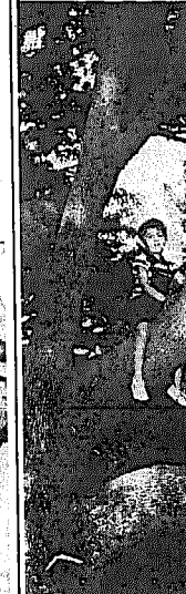
When a youngster is missing, parents look first up in trees.