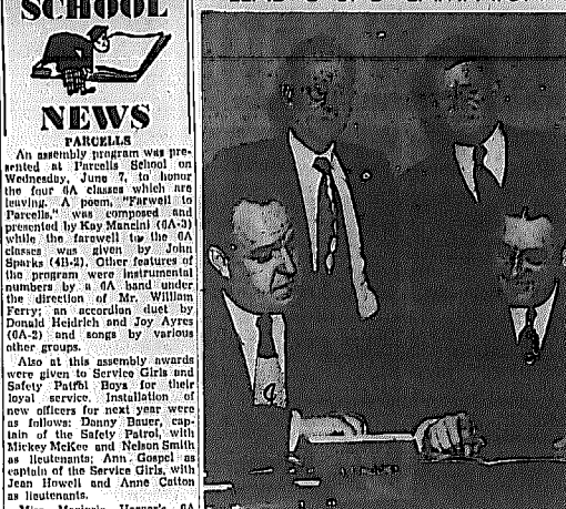
Two Grosse Pointe residents who have taken the lead as associate chairman and major in the University of Detroit Field House campaign program are pictured with other East Side campaign leaders discussing arrangements for a mammoth "kick-off" meeting on Friday, June 16.