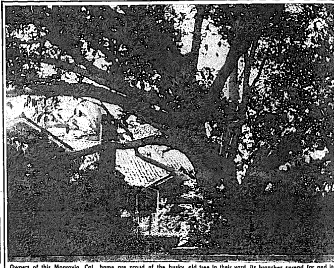
Owners of this Monrovia, Cal., home are proud of the husky, old tree in their yard. Its branches spread far and low.