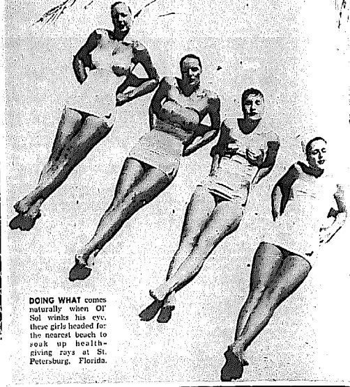
DOING WHAT comes naturally when O' Sol winks his eye, these girls headed for the nearest beach to soak up health-giving rays at St. Petersburg, Florida.