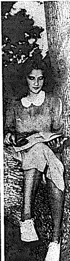
Many high school students like to study on giants' limbs.