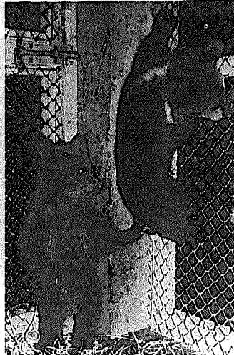
JACK AND DAPHNE , twin brown bears newly arrived at London zoo, cavort in their cage apparently with easy conscience, although they have stolen the affections of Britons from Brumas, a polar bear cub formerly the zoo's star act.