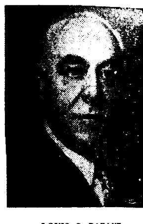
LOUIS C. RABAUT Democrat, Member of Congress