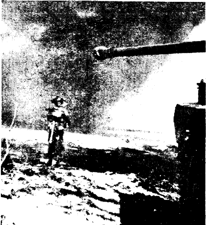
BRITISH ARMY trainee, covered by tank, moves up on an "enemy-held" pillbox at Warminster training grounds, where recruits get training under realistic-as-possible conditions. The pillbox is shrouded by smoke after flame-thrower attack.