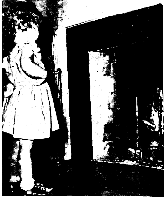
Where is the protective metal screen? Fire fascinates children.

CHILDREN ARE COMBUSTIBLE. Thousands of youngsters die in home fires every year. At least 2,000 fire deaths annually are children under five years of age, too young to save themselves, according to the National Board of Fire Underwriters. Seeking causes of fires fatal to most young children, the U. S. Office of Education studied 800 cases reported in newspapers. Major causes: stove explosions, quickening fires with kerosene or gasoline and playing with matches. In 250 cases children were alone. Death is a cruel blow.