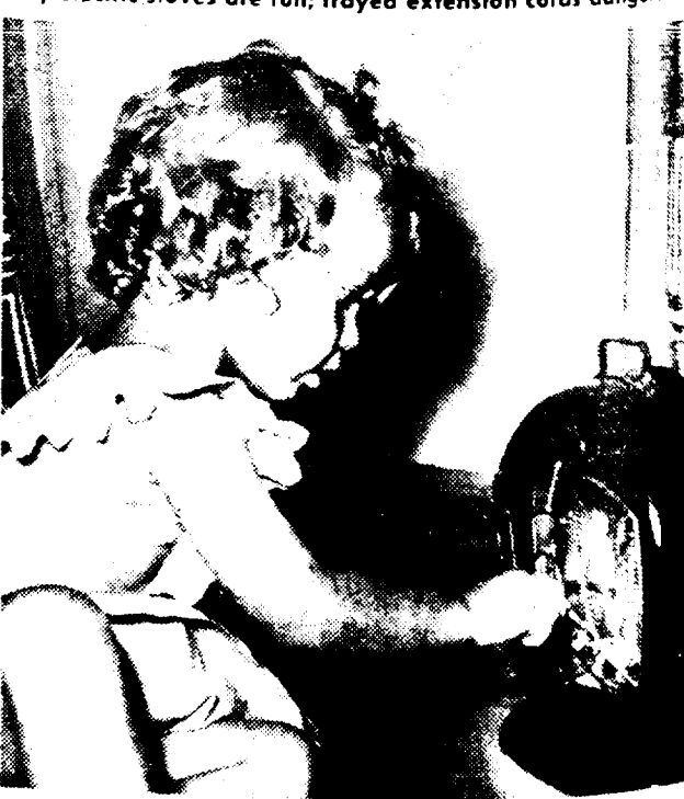
A little girl, still alive, is playing with a portable heater.