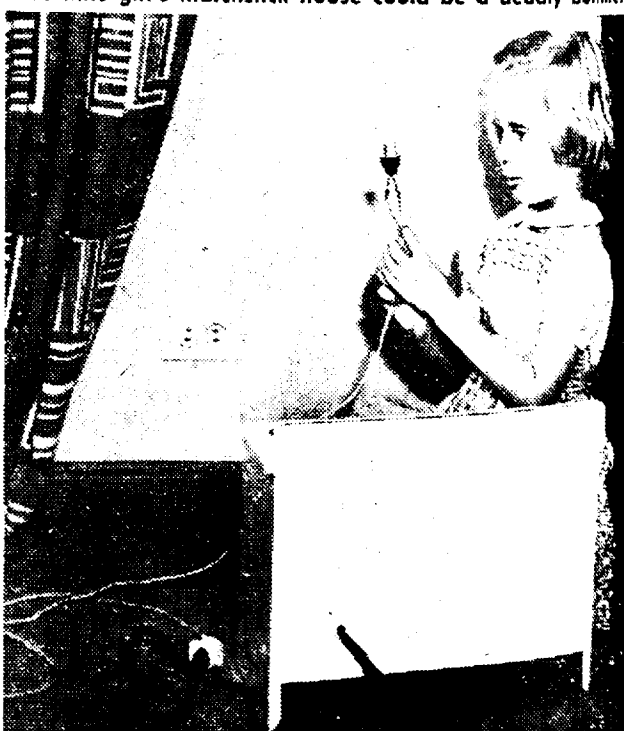
Toy electric stoves are fun; frayed extension cords dangerous.