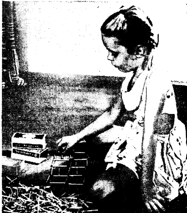
This little girl's matchstick house could be a deadly bonfire.