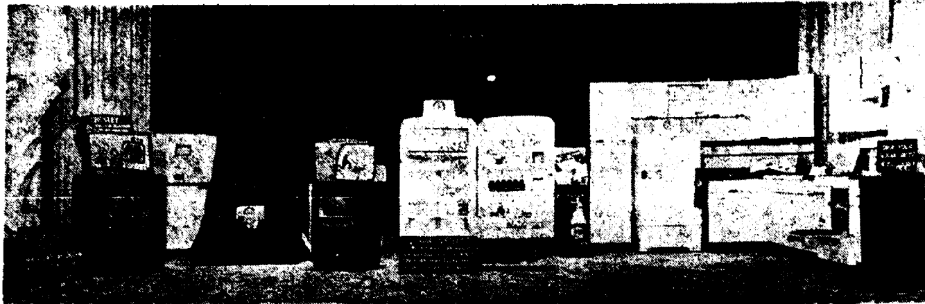
CROSLLEY COMPLETE KITCHEN ON DISPLAY IN WOODS THEATRE LOBBY

Every housewife—and hubby, too—in this area has the opportunity to see an economical, down-to-earth plan for bringing new pleasure and convenience to cooking, baking, food planning, and all the other things that must be done in the kitchen, according to officials of Vulcan Industries, 14901 E. Seven Mile.