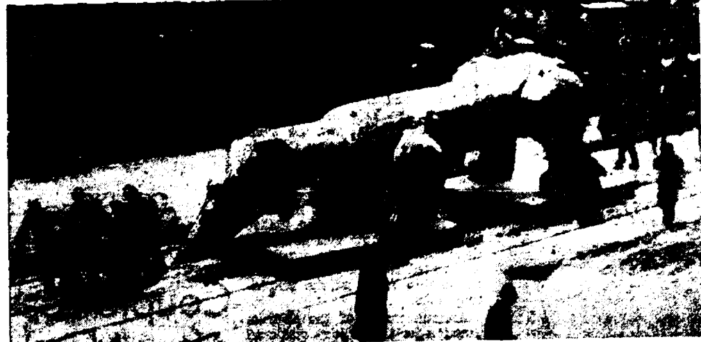
THE BIG THANKSGIVING DAY CHILDREN'S PARADE in Detroit, November 23, heralds the 1950 Christmas season. This will be the twenty-fourth parade, sponsored by The J. L. Hudson Company. A thousand people take part, including eight marching bands and an escort of Detroit mounted police. Hundreds of thousands of people view the spectacle, many coming from throughout Michigan and from neighboring states. The parade starts at 8:45 Thanksgiving Day morning, on Second Avenue at Amsterdam, moves down Second to Vernor Highway, across to Woodward Avenue, then down Woodward to the Hudson store, where Santa ascends the stairs to his castle. The parade will be televised on Station WWJ-TV beginning about 10 A.M.