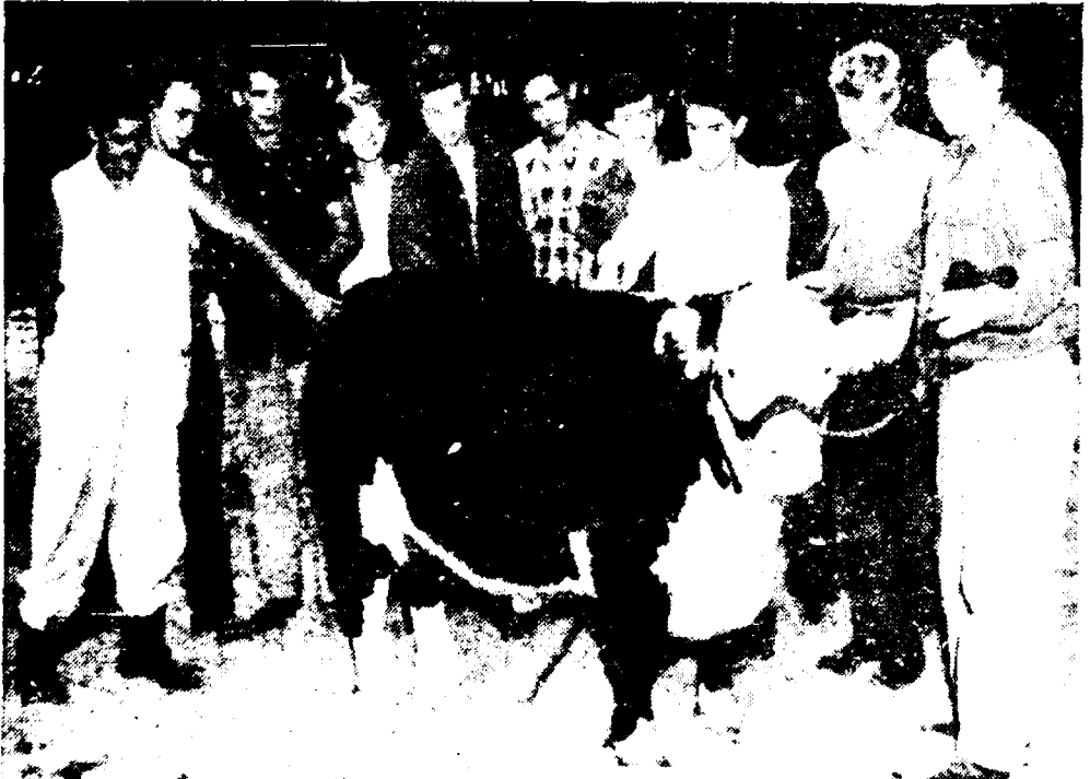
THE COVETED grand champion's crown at the Great Jones county fair fat stock show at Monticello, Ia., went to a well-fleshed Hereford shown by Boys Home, Boys Town, Neb.