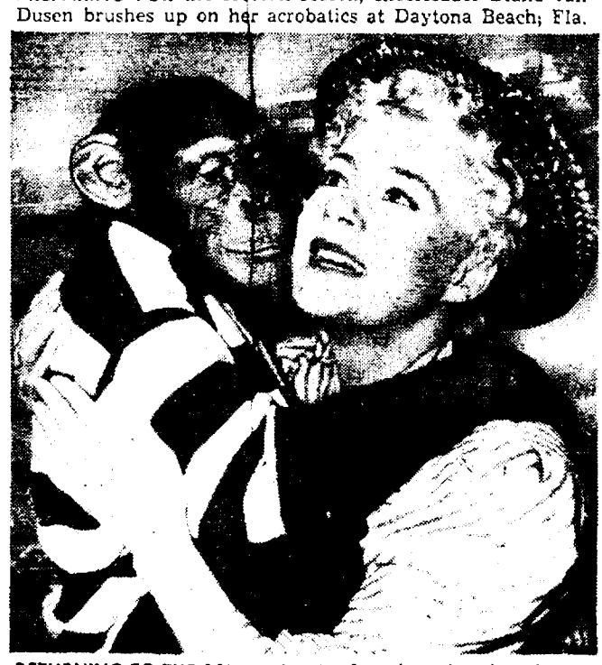
RETURNING TO THE SCREEN for the first time since her throat operation, Betty Hutton will appear in a new musical with Bonzo II. Betty and Bonzo do an elaborate, funny dance.