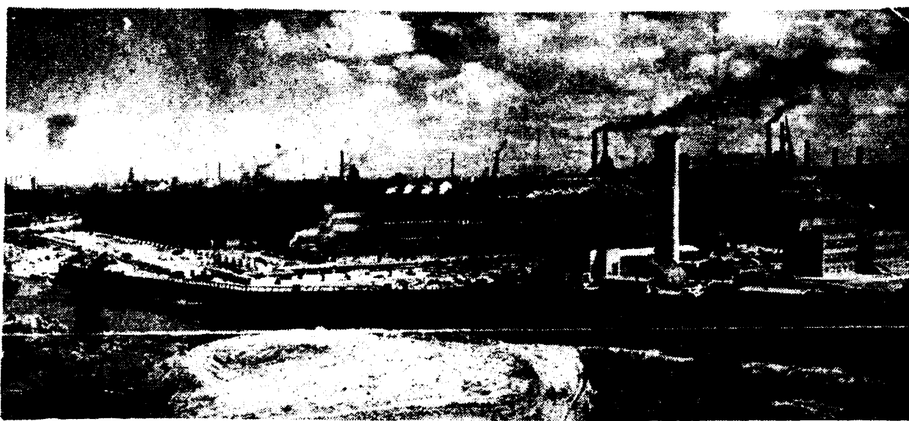
THE WEST side of the Cuyahoga river in Cleveland is calm. On the east side, noise, hustle and bustle herald construction activity as Republic Steel corporation expands operations at its strip mill.