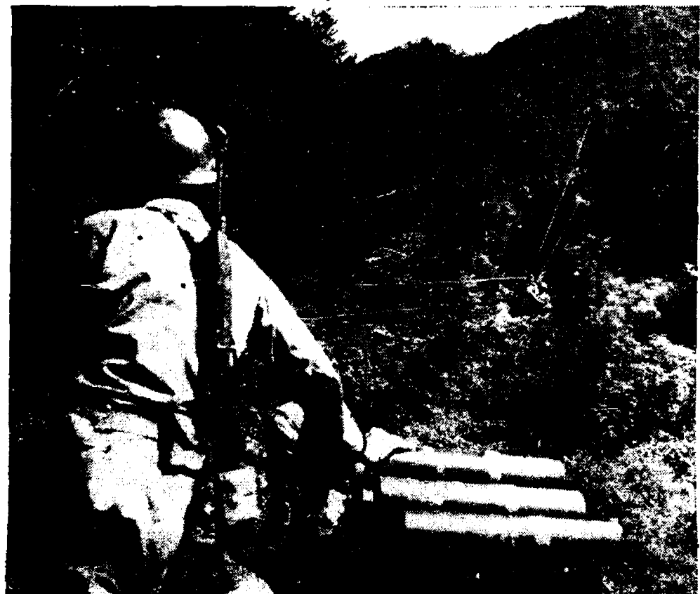
BUILT OVER "IMPASSABLE" terrain to the top of formidable Hill 1073 even while Communists clobbered the hill with mortars and artillery, Korea's longest elevated tramway system lifts ammunition and supplies to defenders. It was built by 13th Engineer combat battalion.