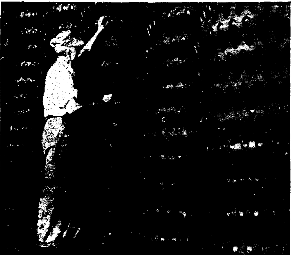
MOUNTING STACKS of new high-flotation tires are checked by a workman at the Akron, O., plant of the B. F. Goodrich company. The tires were developed for use by U. S. Army.