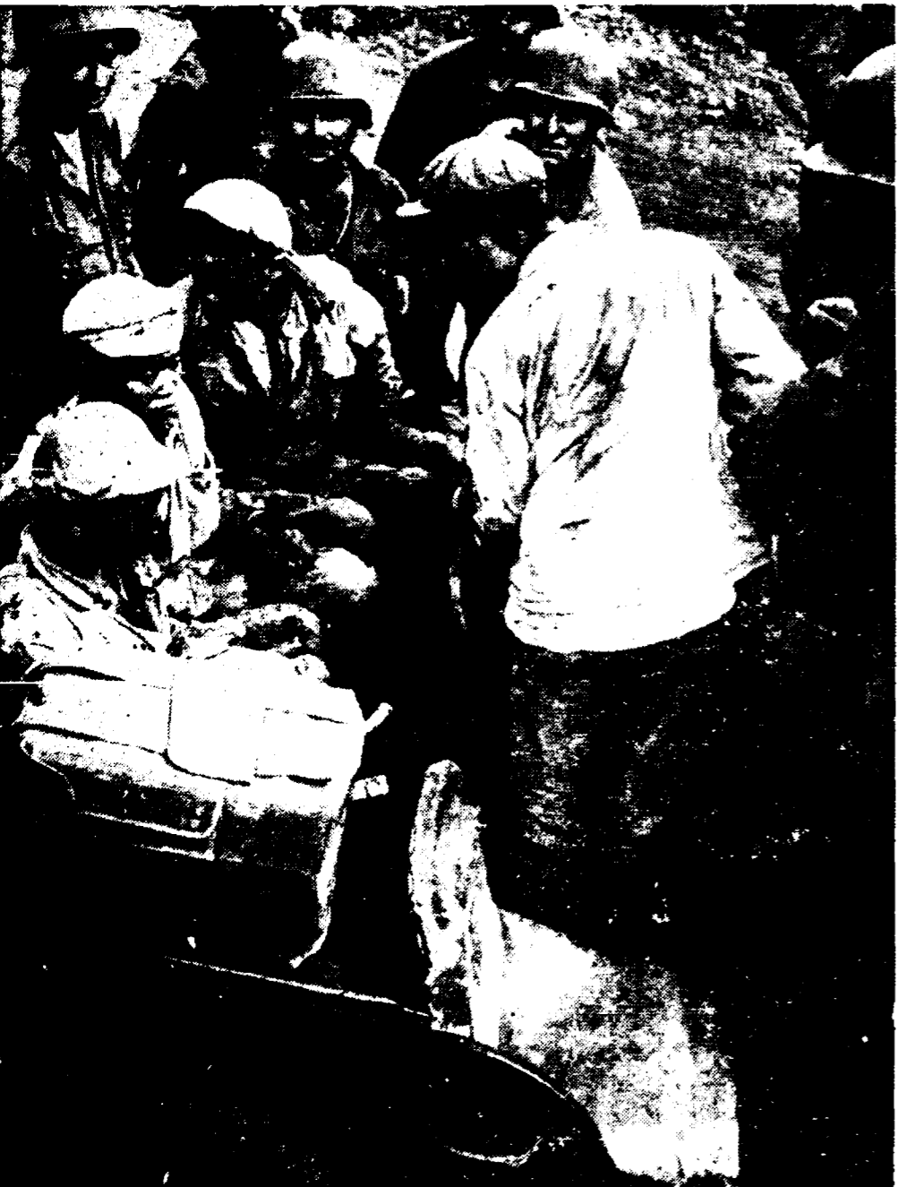
COMMUNIST PRISONERS rounded up on the western Korean front are loaded aboard a jeep for removal to a rear area where U. S. Army officers will process and interrogate them.