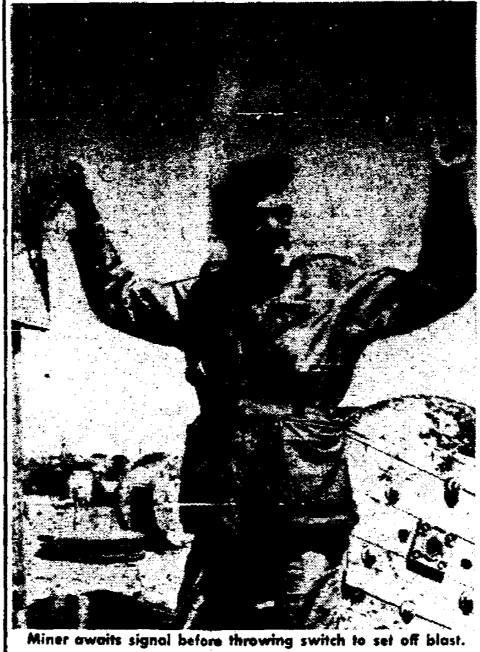
Miner awaits signal before throwing switch to set off blast.

A T A TIME when the free nations of the world are striving to build up their steel industries to meet defense needs, Chile is moving to the front as a "big gun" in the "arsenal of democracy." A narrow, ribbon-like country of some 288,306 square miles, Chile is helping out its bigger South American neighbors, as well as the United States with vitally needed shipments of iron ore and steel. A new steel plant, Compania de Acero del Pacifico, located at Huachipato, the "Pittsburgh" of Chile, is producing steel at the rate of 180,000 tons a year and still expanding. Iron to feed the mills comes from Chile's famous El Tofo mine, a mountain of high grade iron ore set in the vast mineral frontier of northern Chile. Operations are scheduled to begin shortly at a new iron ore deposit at Rameral, near El Tofo. It is believed to hold a 30-year supply of high grade ore. Many allied industries are expected to develop around Huachipato soon. Chile's industries not only give steady work to her people, but hold out hope to other nations through her steel.