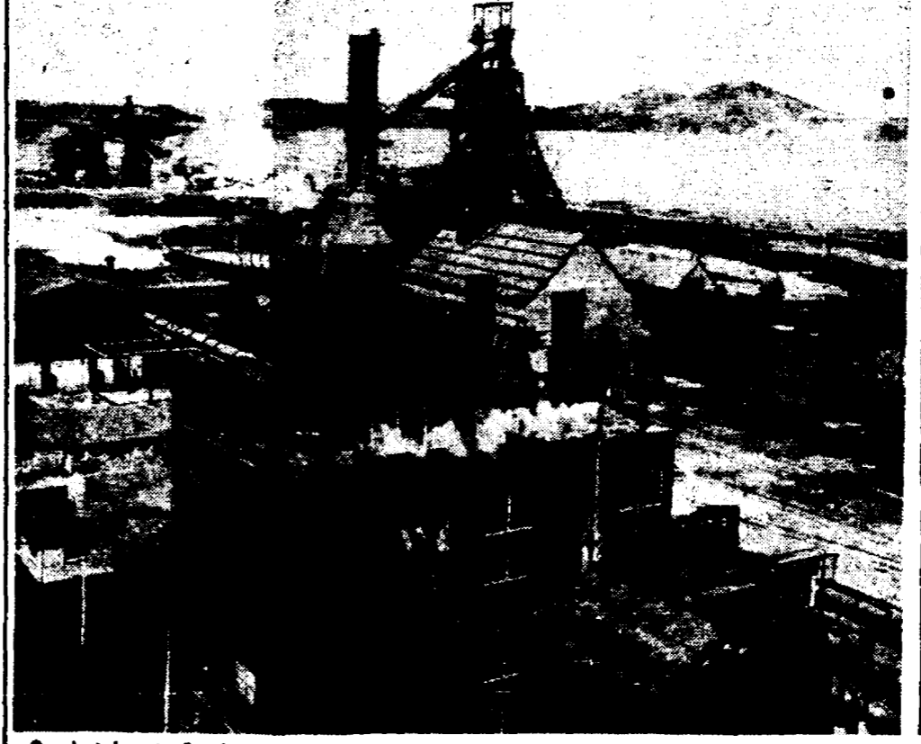
Ore is taken to South America's second largest steel mill at Huachipato, near Concepcion.