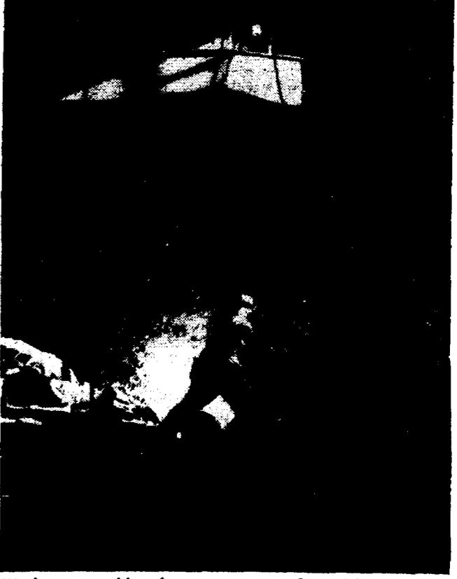
Workers tap a blast furnace to start a flow of liquid metal.