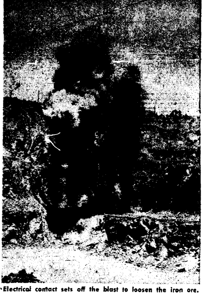
Electrical contact sets off the blast to loosen the iron ore.

A T A TIME when the free nations of the world are striving to build up their steel industries to meet defense needs, Chile is moving to the front as a "big gun" in the "arsenal of democracy." A narrow, ribbon-like country of some 288,306 square miles, Chile is helping out its bigger South American neighbors, as well as the United States with vitally needed shipments of iron ore and steel. A new steel plant, Compania de Acero del Pacifico, located at Huachipato, the "Pittsburgh" of Chile, is producing steel at the rate of 180,000 tons a year and still expanding. Iron to feed the mills comes from Chile's famous El Tofo mine, a mountain of high grade iron ore set in the vast mineral frontier of northern Chile. Operations are scheduled to begin shortly at a new iron ore deposit at Rameral, near El Tofo. It is believed to hold a 30-year supply of high grade ore. Many allied industries are expected to develop around Huachipato soon. Chile's industries not only give steady work to her people, but hold out hope to other nations through her steel.