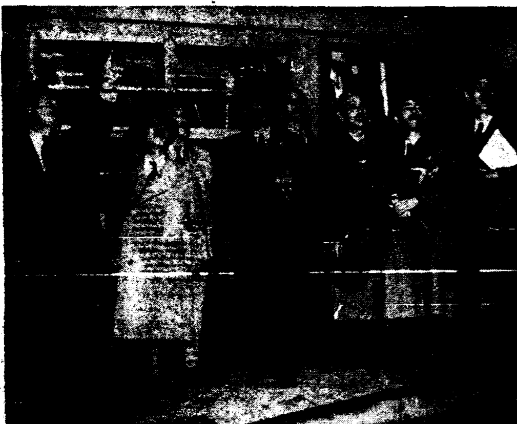
RUBBERNECKING just like any other tourists on their first trip to New York are these Japanese business men touring the United States to inspect manufacturing plant methods.