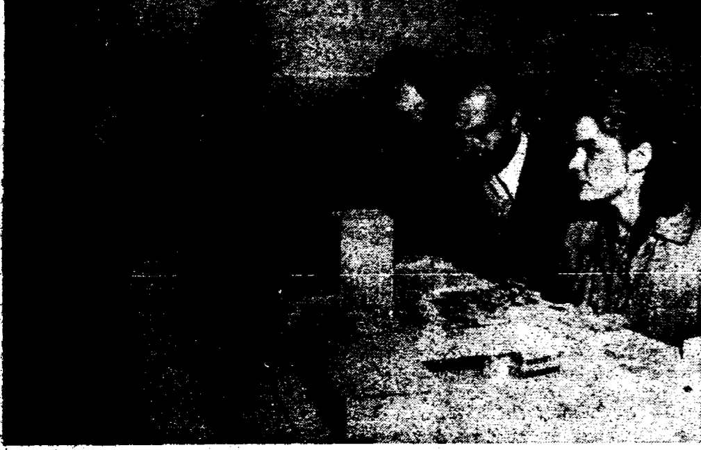
SCHOOL DAYS are not far off for these students who look at a model of the new West Point bridge structure which will be constructed through a Ford Foundation grant.