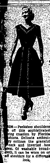
—Peekaboo shoulders—this sophisticated spring creation by Florida designers. Delicate embroidery outlines the graceful neck and inverted bow-sleeve. Of washable broadcloth, it can be worn on or off shoulders for a different look.