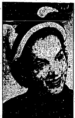
This double-brim felt cloche in navy blue is faced with falla in white, has Morocco's wings of ribbons and is an eye-catching headpiece.