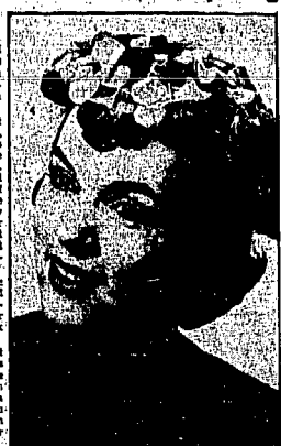
Small flower top of purple and mauve violets is set on a shallow crown. Velvet petals are worked with feather-stitch to make a hat that's right for winter wear with fur.

The small and shiny straw sailor is another resort fashion that's a good bet for wear right now. This, in navy, red or white and will bring for wear, with suit.