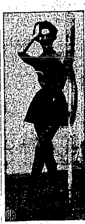
STRIPED FOR ACTION —Smartly tailored for swimming, playing or tanning under the Southern sun, Claire McCordell's three-piece cotton suit is done in sophisticated beige stripes against a dark green background. The sleek halter tops a pair of very brief diapher shorts (for serious sun bathing) that are modestly covered by a slim, wrap-around skirt.

Everyone is more or less foolish—but only a few insist upon proving it.