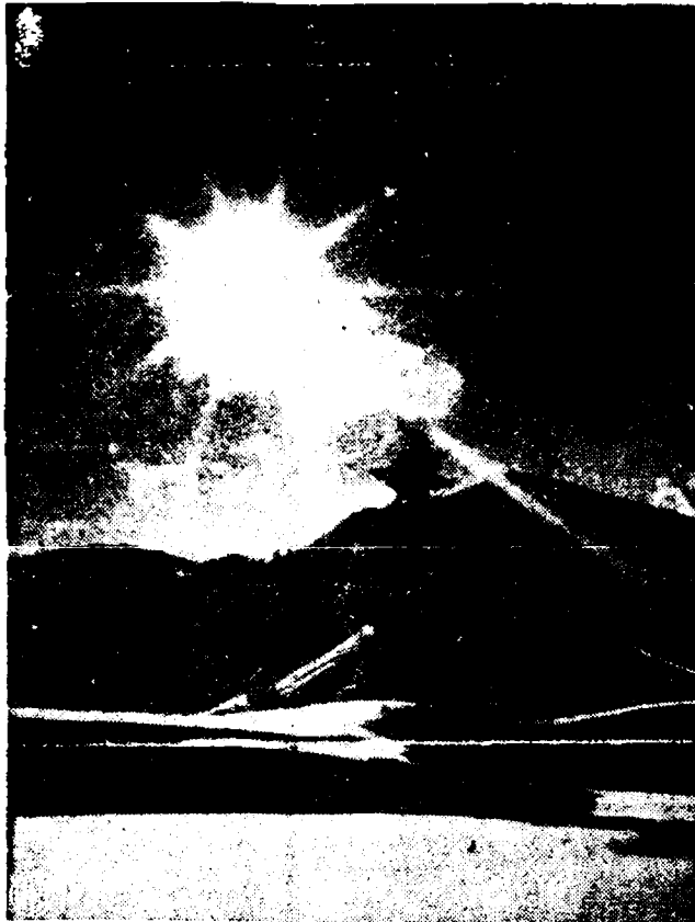
SPLendor OF NATURE — A brilliant winter sun sends starlike rays across the Idaho sky at Sun Valley while mountains lie snug under blankets of snow. A massive tree juts up wearing its snow like an ermine wrap.