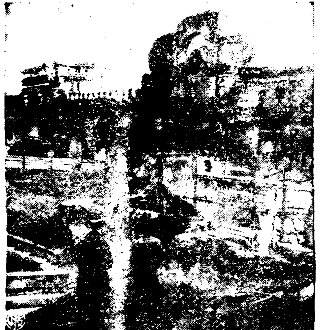
OPEN AGAIN AFTER FIVE CENTURIES — After having been sealed for 500 years, the ancient Roman Asinara Gate (right) is open again. The gate, leading into Rome through ancient walls built by Emperor Aurelian in 271 B.C., was sealed five centuries ago by Pope Gregory XII and a new gate, St. John's Gateway (top left), was opened. Heavy modern traffic convinced authorities a second gate to the city was needed and so the old gate has been restored to its original purpose.