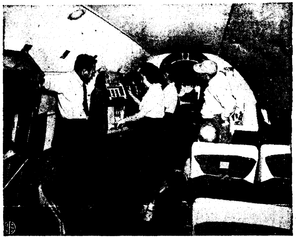
STAKES ARE HIGH — Gambling in the sky features the week-end Dominican Sportsmen's Special plane that will soar between Miami and Ciudad Trujillo, Dominican Republic capital. Called the "Monte Carlo of the Caribbean," Ciudad Trujillo now offers four legal gambling casinos, swank hotels and night clubs, Sunday cockfights and horse racing to winter vacationists seeking legal gambling since the Kefauver investigation closed Florida gambling clubs. Passengers play slot machines, bet on Florida horse races and play cards en route on the 50-passenger four-motored plane. The plane service is expected to go into operation on Feb. 21.