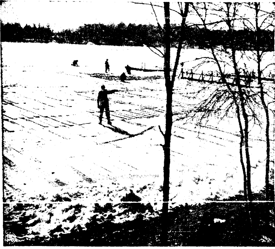
THIS WILL FLOOR YOU! —Carpenters nail together some of the 16,000 board feet of spruce that is being laid over the ice of Nene Such Pond in Natick, Mass. Sand will be poured over the wooden floor and the first thaw is expected to take care of the rest. It is hoped that the planking and sand will sink and permanently cover the mud that has been a hazard to bathers. Sand alone has not solved the problem. It is believed that this is the first time that such an operation has been undertaken.