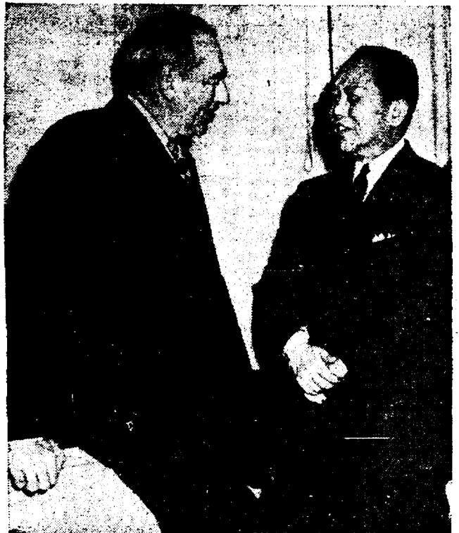
ROMULO VISITS ACHESON — Gen. Carlos P. Romulo (right), new ambassador to the United States from the Philippines chats with Secretary of State Dean Acheson after leaving a copy of his credentials with the State Department. Later he will present his credentials to President Truman.