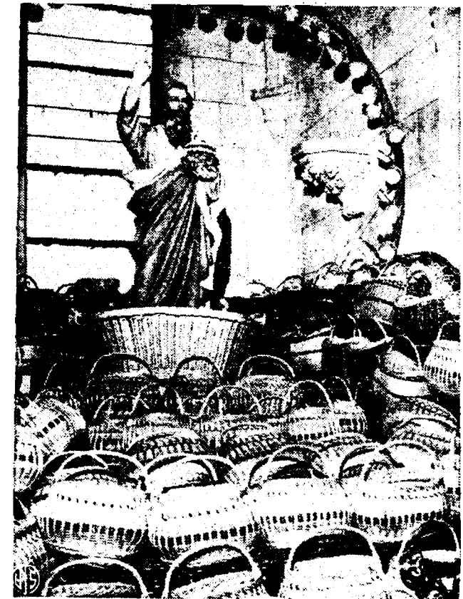
BASKET-MAKERS FEAST —Baskets of all descriptions surround the statue of St. Paul, patron saint of the basket-makers, in the little church at Origny-en-Thierache, France. The apostle escaped besieged Damascus in a basket lowered by friends from the city's wall.