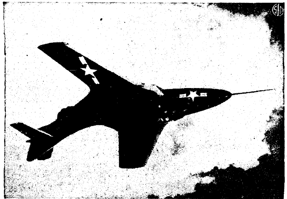
NEW NAVY WAR BIRD —Cutting through the sky over the Grumman Aircraft plant at Bethpage, N. Y., is the F9F-6 Cougar, the latest Navy fighter from that company. Rated for security reasons in the "over 600 m.p.h." class, the Cougar is the swept-wing successor to the battle-proved Grumman Panther, the first jet to be used in combat by the U. S. Navy. The new plane's low landing and take-off speed makes it ideal for aircraft carrier and front-line combat field operations.