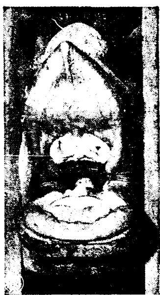
GRAND OPENING — The Indian rhinoceros in Rome's zoo can't suppress a polite yawn after putting away an afternoon snack of 25 pounds of green grass. This awe-inspiring view doesn't seem to back up the fact that the rhino, like the whale, cannot swallow any food larger than a walnut, unless the food is completely crushed. The powerful jaws come in handy for the crushing task.