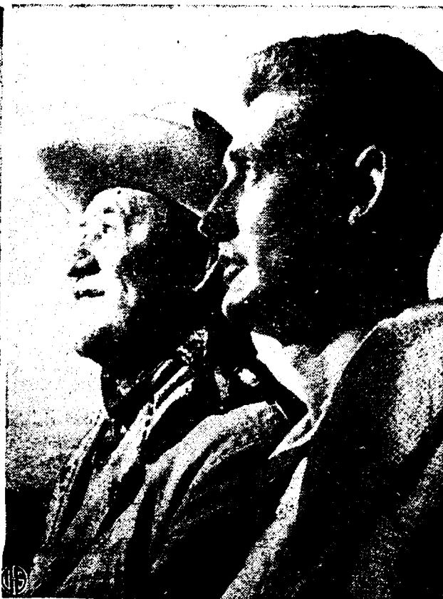
TWO SHINING STARS —Seldom does the camera have a chance to capture the profiles of two famous American athletes—especially when the two stars shone a generation apart. Ted Williams (right), Boston Red Sox great slugging outfielder, shares the reflection of fame and top performance with Jim Thorpe, regarded by many as the greatest athlete of all time, in this unusual camera impression. The picture was taken at the Boston Sportsmen's Show.