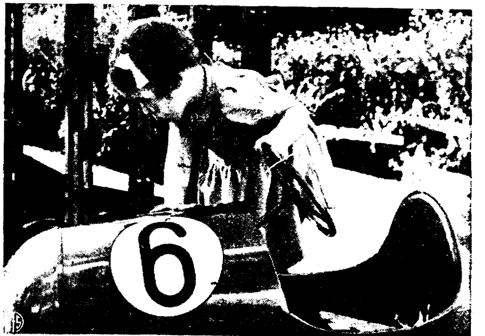
YOUNGEST DUTCH PRINCESS —Princess Marijke, the youngest Princess of the Netherlands, takes a serious look at her little automobile. Princess Marijke's fifth birthday is celebrated today.