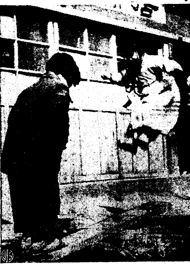
UPSY-DAISY - Without wear and tear on a sofa, two Korean children enjoy their favorite game, Nul, in the war-shaken capital of Korea. The acrobatic game, in which one child leaps up from a board as another child lends impetus by coming down on the other end, is a traditional pastime with Korean girls.