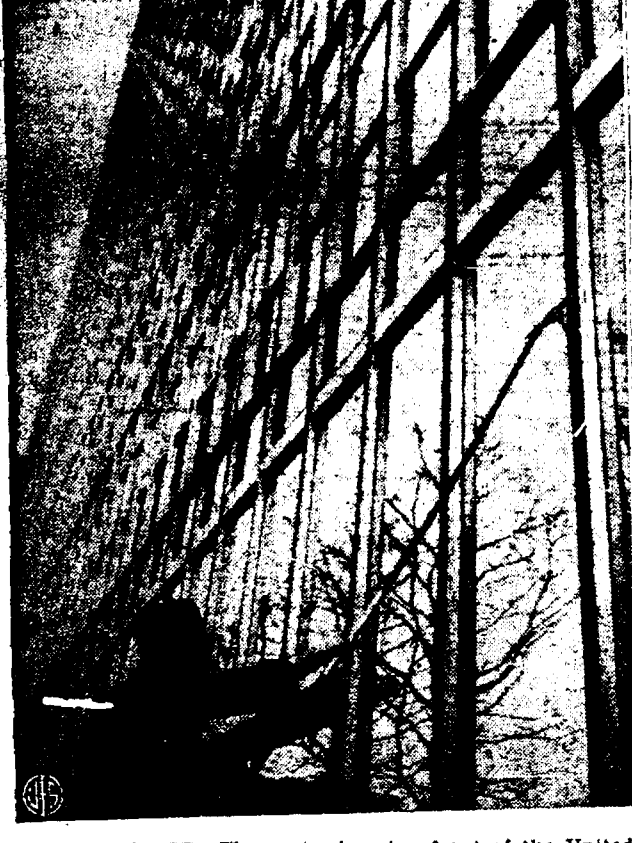
PANE-FUL JOB-The vast, gleaming front of the United Nations Secretariat Building on New York's East River gets its periodic window cleaning. Manhattan housewives who complain about spring cleaning, and the problems of shining up the glass panes, might compare their own windows with the thousands of square feet of glass that this window cleaner must polish—and heave a sigh of relief