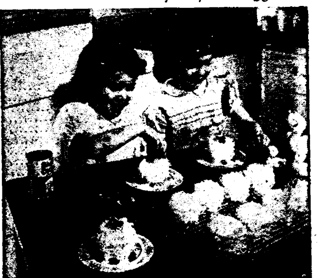
Of course, it is no news when the Easter Bunny lays an egg. The Easter Bunny has been laying eggs for years. But has the E. B. ever found at your house convenient little nests for his eggs, like those atop the handsome party cupcakes pictured here? The cakes may be made at home—with instant white cake mix, if time is short—or bought at your bakery counter. Cover them with frosting and plenty of snowy white or delicately pastel-tinted coconut; then let the children take over. They will love arranging gay jelly bean eggs in these natural little nests.

To fint eccount place 1 teaspoon milk or water in a bowl. Add a few drops food coloring and mix well. Add 1½ cups shredded eccount and toes with a fork until eccount is tinted throughout.