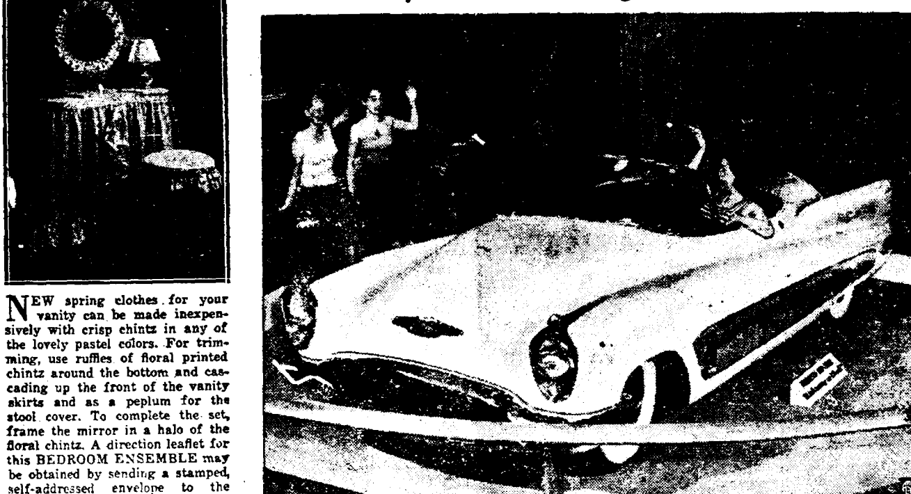
One of the eyecatchers attracting record crowds at the 44th annual Chicago Automobile Show is Buick's super-powered "dream" car, the XP-300, with its aluminum body and gold hubcaps. Powered by a 335 horse-power super-charged V-8 engine, this car is described by Buick as "a laboratory on wheels." It was built for experimental purposes only and Buick engineers say that some of the special features now undergoing tests on the XP-300 may some day appear in the family automobile of the future.