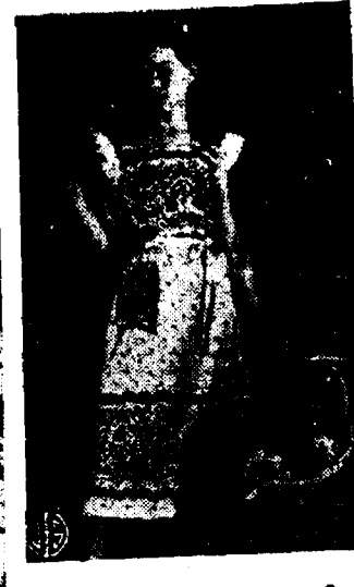
PERT PINAFORE - for Southern wear now and daytime duty up North next summer, Winnie Mae's floral-printed percale pinafore goes from house to garden to town in cool comfort. Buttoned from collar to hem at the back, brilliantly bordered at hem and bodice, University. the frock boasts a huge carry-all pocket beneath Its how-tied waist.