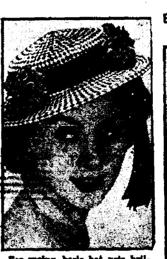
For spring, basic hat gets bril-liant red flowers and matching band for trim. Hat is a saller in checked black-and-white straw. ge of trian, hat will