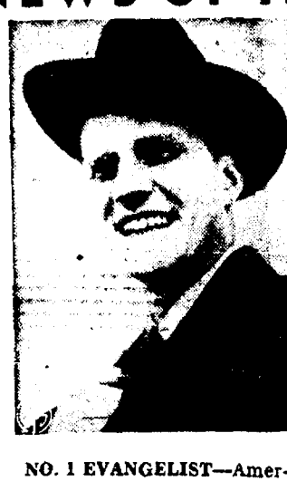
NO. 1 EVANGELIST-America's No. 1 evangelist, 35-year-old Billy Graham, greets Britain with a smile upon his arrival in Southampton. Slated to address 500 members of the British clergy, Graham will exchange views on programs of religion in England and in the U.S. at a meeting in