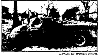
The intersection at Westchester and River is not a stop street, and two drivers took a chance Saturday afternoon that the other car would stop. An automobile driven by Alan Millers, of 110 Westchester was struck and spun around by an automobile driven by W. Newman, of 1551 Lakeside. The Millers car struck a electric light pole which broke off at the base and crashed down on the rear of the car. None was injured. Both drivers received tickets.

Individual chicken pies and hot cream puffs will be on the menu.