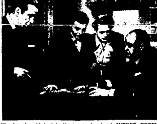
The hilarious bit dialogue in the hands of KIDNEY GREENE, GREER (right) stars in "The Maltese Falcon"...