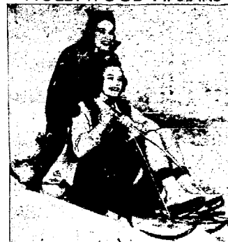
FAYE EMERSON and ALEXIS SMITH —soon to be making the most of a day's outing at Big Bear Lake in the snow country above Hollywood. Faye will be seen in Warners' "Jute Girl"; Alexis in "The Constant Nymph," based on the Margaret Kennedy novel.