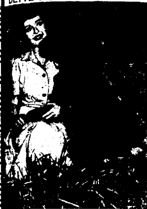
BETTE DAVIS —First Lady of Movieland—with one of her many dogs. Bette was a founder of "The Tailwaggers Club" the names of which include the famous "Seeing Eye" dogs for the blind. Her next starring vehicle is Warners' "In This Our Life" stars Olivia de Havilland, Dennis Morgan and George Brent.