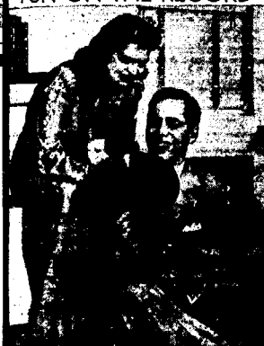
HUMPHREY BOGART and MAYO METHOT —in private life they are the agreeable Mr. and Mrs. Bogart—have what is probably the largest collection of records, all the way from classic music to pop, in the film Capital. Bogart's next starring vehicle is Warners' "All Through the Night" directed by Vincent Sherman.