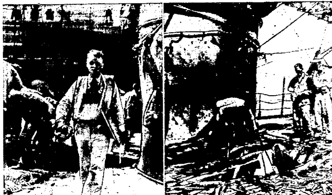
At left, a pilot who took part in the raid on Marshall Island is pictured; bomb Japanese bases. At right sailors are clearing up the debris from after he returned from his mission, to the carrier which sent him to a Japanese bomb after Jap airmen tried in vain to hold off the Yanks. (Continued From Page 8)