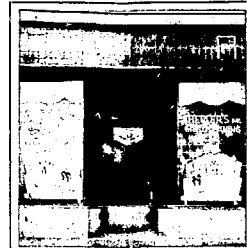
Indian Village Branch Located at 8365 E. Jefferson, near Hibbard