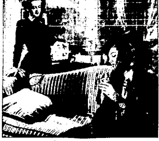
BETTE DAVIS and ANN SHERIDAN share starring honors in "The Man Who Came to Dinner"...