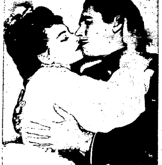
Olivia de Havilland and Errol Flynn in their newest starring film, "They Died with Their Boots On," the story of General Custer and his famous Seventh Cavalry regiment, coming to the Vogue Friday.