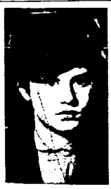
12-year-old Roddy McDowall portrays Hue Morgan, past whose eyes all the tender, memorable business of life flows in Richard Llewellyn's "How Green Was My Valley."

"The Feminine Touch," in this instance, may not be more deadly to the male, but it's more lively, Kipling to the contrary.