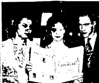
Three Grosse Pointe young women will receive their degrees at the 32nd annual commencement at Marygrove College, Detroit, Thursday, May 21, at exercises at 2:30 p. m. in the college auditorium.