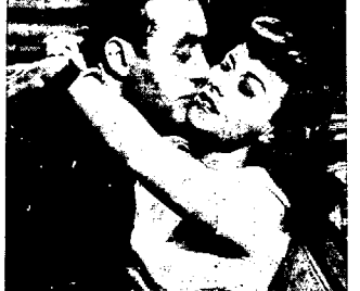
LOVE DRAMA—Glamorous Paulette Goddard and Charles Boyer shown in an intimate moment of Paramount's great romantic film, "Hold Back the Dawn," coming to the Esquire Theatre on Sat.-Sun.-Mon. Boyer and Paulette are co-starring with lovely Olivia de Havilland.