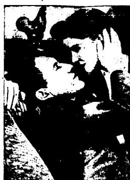
That's what Spencer Tracy gets in "Woman of the Year" the picture which comes to the Cindarella screen Friday. It is the first time the popular star has teamed with the vibrant Knie.