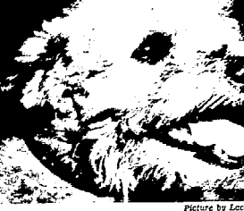
Where will this little dog go? This Poodle puppy has been the ward of the Grosse Pointe Park police for more than a week. He's awfully tired and hot, as this picture shows, and wants a home pretty badly. The Michigan Humane Society has assured the News that the little fellow will be held until Sunday and then given to any worthy person who wants him.