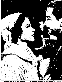
HEDY LAMARR and ROBERT YOUNG in "H. M. Pulham, Esq.," the film taken from the J. P. Marquand best seller. Hedy is the Career girl who Bob remembered for 20 years, Marvyn Slythe. The pictures come to the Vogue screen Friday.

Tired of hearing salvage volunteers complain that transportation was hobbled by their efforts, two Goldsboro, N. C. women borrowed a neighbor's truck and collected more than two tons of scrap metal in a single day.