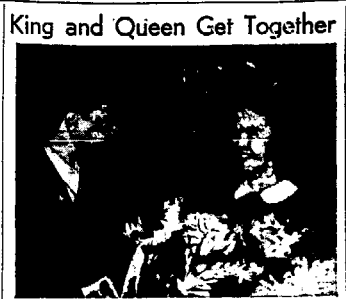
SHIRLEY TEMPLE was greeted by MICKY ROONEY when she ended her year and a half of retirement from the screen. A breakfast here greeted the young Shirley company to the Esquire screen Saturday for three days in "Kathleen." Robert Taylor and Lena Turner are in the companion picture. "Johnny Eager."

Willow Run Willow Run is not two mere words. It stands for America's growing power in the air. It is a symbol of our hopes for victory. Its four-motored bombers, produced to the extent of "dozens daily" are capable of flying from the new Ford Airport at Dearborn to any military airbase on the globe. They can leave Willow Run at 8 a. m. in the morning and arrive the next day in Europe. Superman couldn't do much better himself. While the government prevents publication of vital information, nearly 200 Michigan newspaper editors were given an exclusive tour of the giant aerial hatchery last Friday, May 22, and they learned much about it. The visit, arranged by the Ford Motor company with permission of the war department, afforded a new insight into war complexities of the Michigan home front. For example, where was each