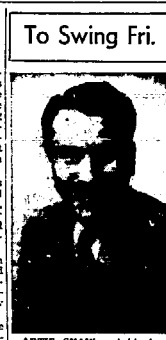
ARTIE SHAW and his band are coming to the Michigan theater beginning Friday for a week's personal appearance before joining the United States Navy.