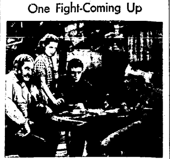
Starting at the Vogue on Friday, ALAN HALE, BRENDA MARSHALL, DENNIS MORGAN and JAMES CAGNEY will appear in "Captains of the Clouds." This flash looks like the warning sign for a battling good fight.