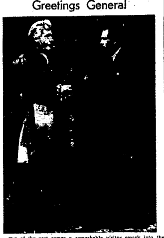
Out of the past comes a remarkable visitor smack into the middle of the present, none other than GENERAL ANDREW JACKSON, (Brian Donlevy), to help his young friend, WILLIAM HOLDEN, straighten out his romantic difficulties with Ellen Drew. The scene is from "The Remarkable Andrew," to be seen at Equine Theatre Saturday, Sunday and Monday.