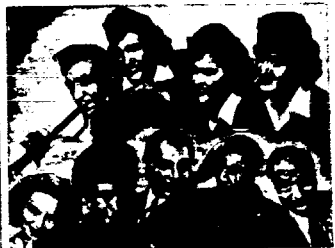
"Private Buckaroo." Universal's hilarious comedy musical, costars Harry James (Top L.), with his Master Makers and the Harmonettes, and with Sammy Kaye and the Kaye Chorus.