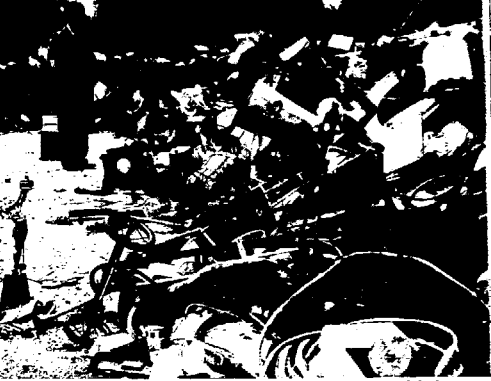
NEIL BLONDELL, Pointe representative on the County Salvage Board, looks over a portion of the metal scrap collected last weekend in the City of Grosse Pointe. Residents from all over the area entered into the drive with enthusiasm and the district produced 198 tons for consignment to the Axis after it is converted into tanks, planes, battleships and bullets.