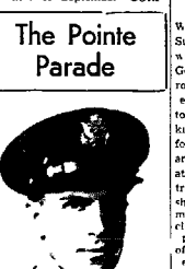
The Pointe Parade