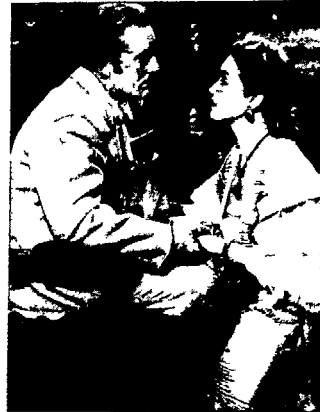
For DOROTHY LAMOUR in Paramount's Technicolor musical of three to ely young nurses part of a group who are sent to Bataan. What happens to them there and subsequently on Corregidor is said to make the picture one of the great film stories of all times.