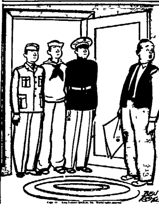
"Daughter, are you expecting a tank force?"