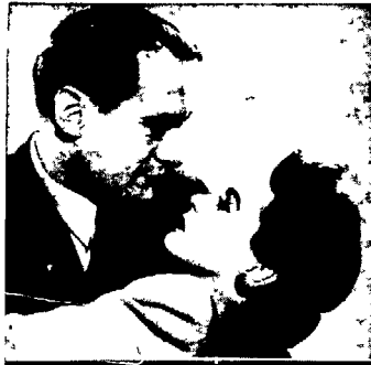
GEORGE SANDERS and MARGUERITE CHAPMAN may be enemies in Columbia's "Appointment in Berlin" but that doesn't stop them from falling madly in love. The scene is from the exciting spy drama now at the Lakewood Theatre and the story, it is a blood tingling adventure drama dealing with that strange shadowy world of international espionage.