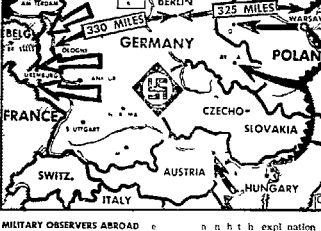
MILITARY OBSERVERS ABROAD... (International)