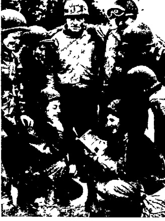
TWO MILITARY POLICEMEN help a group of WACS to become oriented...