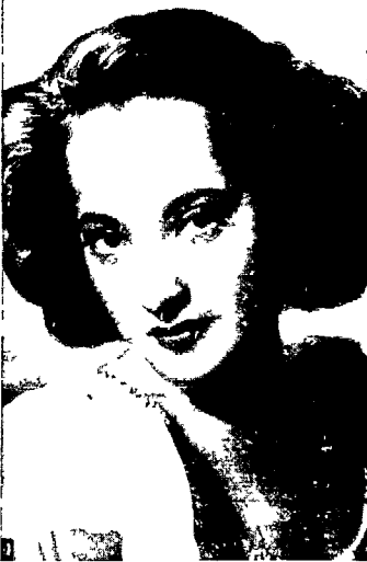
Lovely Merle Oberon currently starring in the picture "A Song to Remember" at the Theater of Romance Tuesday Jan 9 via Columbia network.