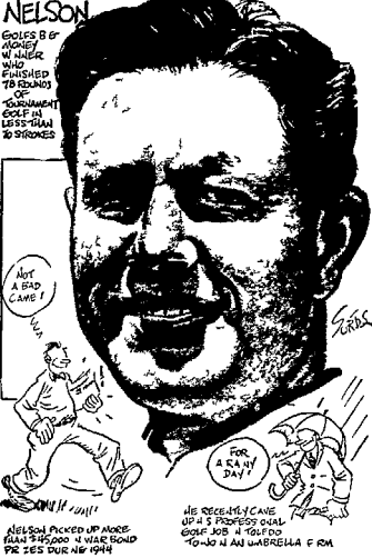
BYRON NELSON GOLES B of GOLF W HERE WHO FINISHED 78 HOLES IN TOURNAMENT... NICKEL PICKED UP MORE THAN $100,000 IN WARE BOND FOR THE YEAR... HE RECENTLY CAME UP IN A PROFESSIONAL GOLFERS ASSOCIATION TO GO IN AN UMBRELLA FOR THE RAINY DAY...