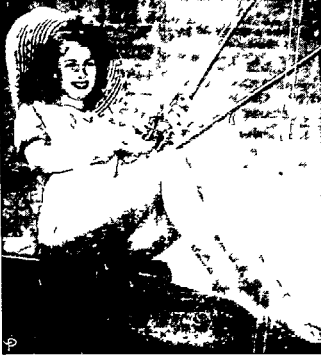
ANY CHIVALROUS FLORIDA fish must realize that he's out on a limb as the pure should prize... the queen of the fishing tourney... any girl of the Miami Herald... been the queen of the 10th Annual Metropolitan... fishing tourney... been warned not to fish for the prize... (The Atlantic)