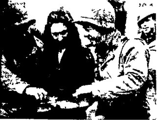
HERE ARE SOME of those cigars you've been trying to get... They're at the front, in Germany... And they're being handed out by a pretty girl...