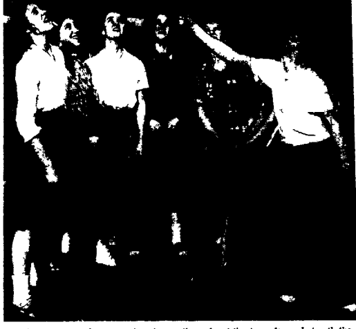
A young man's fancy may turn to something else at this time of year, but with the small fry the first warm days mean baseball games...