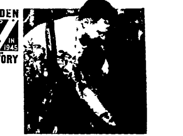
GARDEN FOR VICTORY MESSAGE IS CONTRIBUTED BY GROSSE POINTE WOODS KIWANIS CLUB

The dog was a fine young male we hired terrier but had no collar or license. Another dog was killed at 8:45 o'clock Sunday night by an unknown driver in front of 16641 E. Jefferson. This dog also lacked collar or license tag.