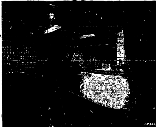
This newly completed purchase department handles all retail orders for lumber and supplies at the SIBLEY LUMBER CENTRE, retail division of the F. M. Sibley Lumber Co. at the company's main yard, Kercheval at Bellevue avenue.