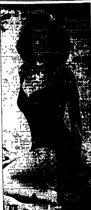
Dublin-born Geraldine Fitzgerald comes from a famous Irish theatrical family. She enjoyed a distinguished career in Irish theatres and in British films before coming to New York in 1938 to appear with Orson Welles' Mercury Theatre. Geraldine has since appeared in several outstanding American pictures, and has recently completed two Warner films, "Nobody Lives Forever" and "Three Strangers." Both films are now awaiting release.