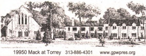
19950 Mack at Torrey 313-886-4301 www.gpwpres.org