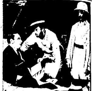
Sir Cedric Hardwicke, left, and Jerome Cowan, center, tell Frederic March they have invaded his island paradise for his hidden fortune, in this scene from "Victory," showing at the Vogue theater.