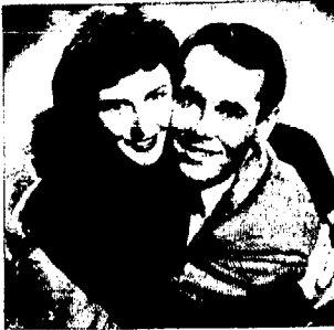
Locked in each other's arms are Barbara Stanwyck and Henry Fonda, stars of the new Paramount picture, "The Lady Eve," which comes to the Cinerella theater Friday for seven days.