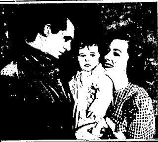
Irene Dunne and Cary Grant are co-starred in Columbia's new romantic hit, George Stevens' "Penny Serenade" which plays at the Punch and Judy Theatre this Sunday thru Thursday.