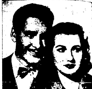
Brenda Marshall is the devoted wife in "Footsteps in the Dark" now at the Vogue Theatre, but hubby Errol Flynn doesn't want to stay home nights.