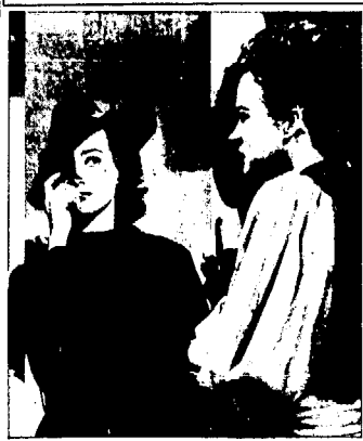
Joan Crawford and Melvyn Douglas in a scene from the dramatic film, "A Woman's Face", coming to the Cinderella Theatre this Friday.