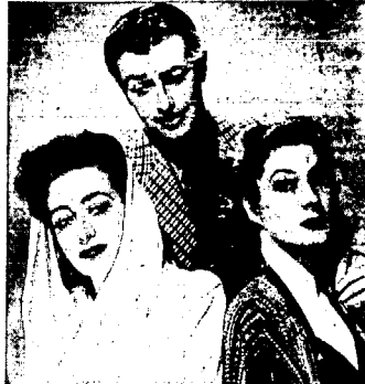
JOAN CRAWFORD, ROBERT TAYLOR and GREEK GARSON in their hearts beating in three times in the new picture, "When Ladies Meet," coming to the Vogue and Judy Theaters. Herbert Marshall will also be seen in the film. Robert Z. Leonard of "Ziegfeld Girl" fame, directed.

"When Ladies Meet" which comes to the Punch this Sunday, Monday and Tuesday with Joan Crawford, Robert Taylor, Greer Garson and Herbert Marshall. Matrimonial complications of a preoccupied husband and an unoccupied wife make up the sprawling basis of "My Life with Caroline." Ronald Colman's new starring vehicle which is at the Punch Wednesday and Thursday, January 7 and 8.