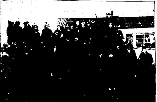
Twenty-five little girls from the St. Vincent Orphan Asylum on the left, and the members of the Richmond Saddle Club on the right, are having a party in the club. This is the first such party for the Saddle Club, whose membership is composed of a great many Grosse Pointers. From the looks on the faces of the girls they were having a great time. Refreshments later were furnished by the Grosse Pointe Toy Club.