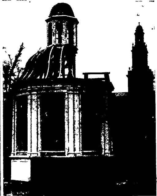
Work is progressing rapidly on the Grosse Pointe Honor Roll which will be unveiled on the High School campus on Memorial Day. The structure will contain the names of more than 1100 Pointe men and women in the armed services at the time of unveiling. More will be added as time goes on. The names printed on plastic will be hung behind the structure.