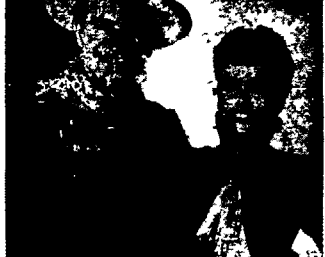
JOHN WAYNE and MARTHA SCOTT currently appearing in "In Old Oklahoma" which comes to the Lakewood Theater Sunday, Monday and Tuesday, May 15 and 17