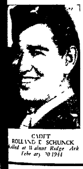
CAPT ROLLAND E SCHUNCK Killed at Walnut Ridge, Ark February 20 1944