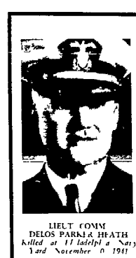
LIEUT COMM DELOS PARK & HEATH Killed at 11 latitude & Navy 12nd November 1941