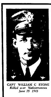
CAPT WILLIAM C STONE Killed over Mediterranean June 13 1943