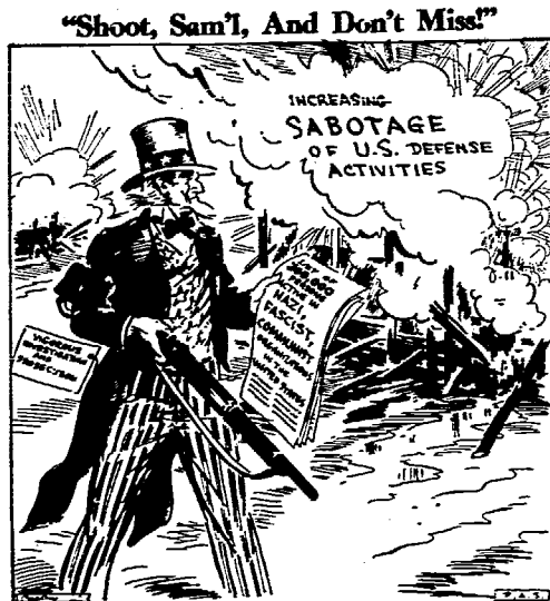
INCREASING SABOTAGE OF U.S. DEFENSE ACTIVITIES

There are rumors around Washington that the President will be asked to resign. The President is said to be in poor health and is said to be unable to perform his duties. The President is said to be in poor health and is said to be unable to perform his duties.