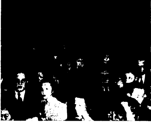
Some of the big crowd that attended the Men and Maids Ball at the Fort Wayne Hotel Saturday night and turned in upwards of 7000 for the Bundles for Britain Fund