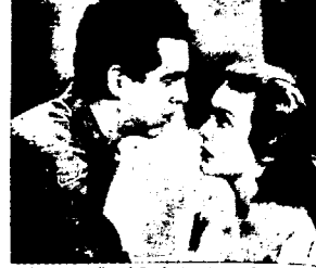
Madeleine Carroll and Fred MacMurray Get Together Third Time in "Virginia," Gay, Modern Comedy at Cindarella

A gay modern comedy drama set off by striking technicolor, brings Madeleine Carroll and Fred MacMurray together as a team for the third time when Paramount's "Virginia" opens Friday at the Cindarella Theatre.