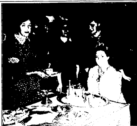
Seen At Parent-Teacher Tea