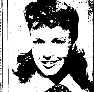
Ginger Rogers in "Kitty Foyle," the picture taken from Christopher Morley's novel, which comes to the Drive-In Theater this Sunday.