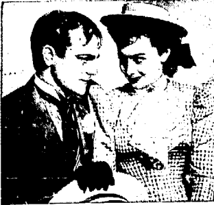
Jimmy, that devil with the women, is doing his stuff in Gay Nineties style with Olivia DeHavilland, the girl he adores in "The Strawberry Blonde," coming to the Punch and Judy and Vogue theatres.