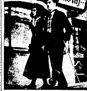
Paulette Goddard and Charlie Chaplin are taking a walk, but there's more than meets the eye in the exciting scene from "The Great Dictator," which comes to the Cinderella theater Friday.