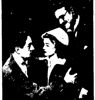
William Powell is supposed to be crazy in this scene from "Love Crazy," which will be on the screens of both the Vogue and Punch and Judy theaters during the week.