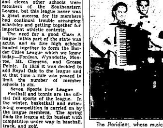
The Floridians, whose music is enjoyed by the dancers every evening in the famous room of the Whittier.