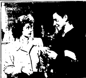
Lucille Ball and George Murphy in the screwball comedy, "A Girl, a Guy and a Gob," which opens Sunday at the Drive-In Theatre.