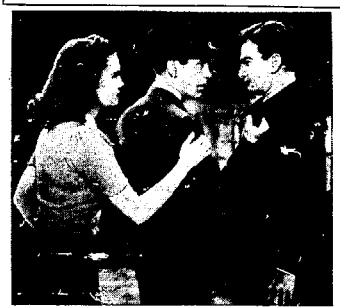
Miss Joan Leslie, who appears Friday on the stage of the Vogue, is the objection Albert's attentions who is the object of Bogart's attentions.