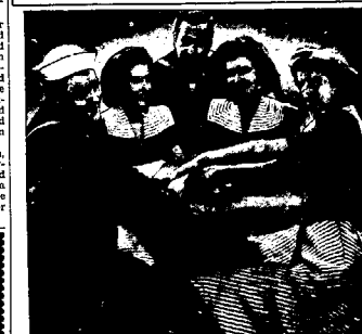
Lou Comstello, Bud Abbott and the Ardrey Sisters in the gay comedy, "The Navy," which plays at the Punch and Judy Theatre this Sunday, Monday and Tuesday.