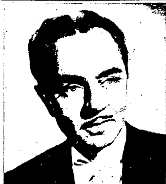
William Powell, co-starring with Myrna Loy in their latest picture "Love Crazy," coming to the Alger theatre Friday.